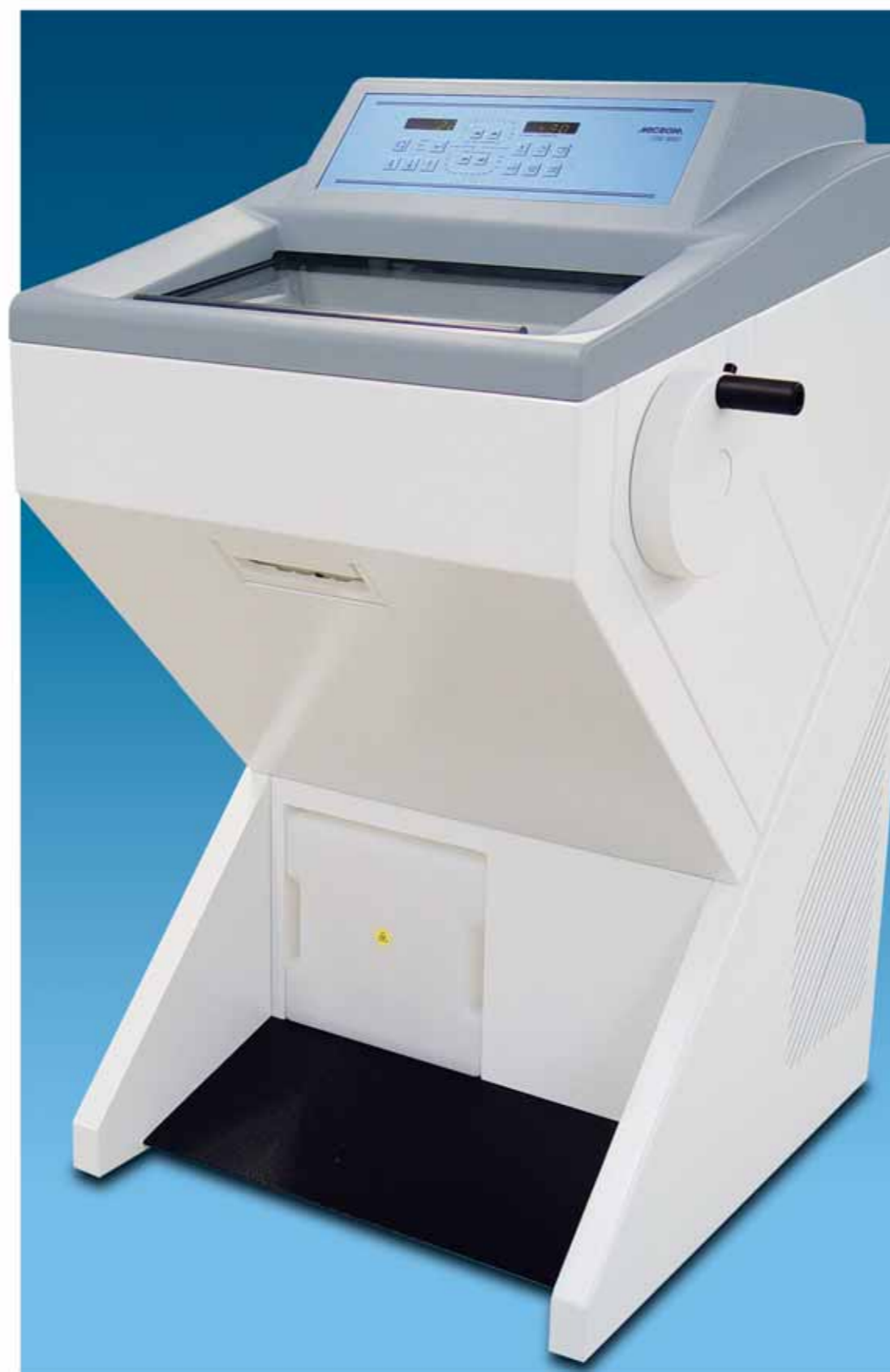
*Accessories not included.

This easy and uncomplicated specimen orientation allows the fast orientation of the specimen in relation to the knife.