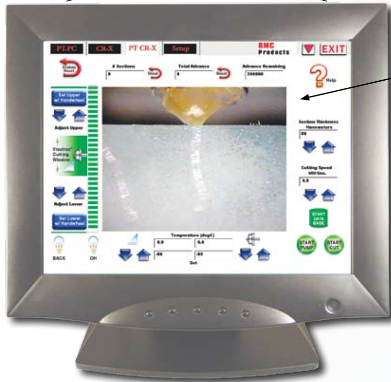
15" LCD Touch Screen Monitor